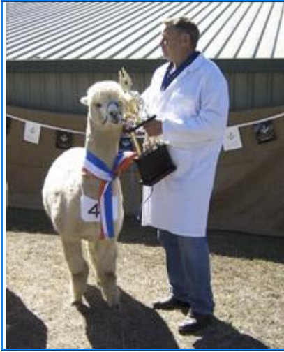
Supreme Champion Huacaya Eleebana Statesman